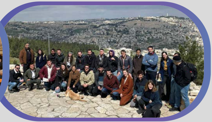
Participants gather for a dual narrative tour of East Jerusalem led by an Israeli and Palestinian tour guide, including meetings and discussions with East Jerusalemites, Jerusalem 4.3.2022.