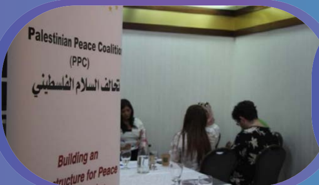
Participants sharing and correcting preconceptions about the other side and some sharing personal stories of their experience in the conflict, Joint Palestinian-Israeli Two Days Seminars, Haifa 16-17.6.2022