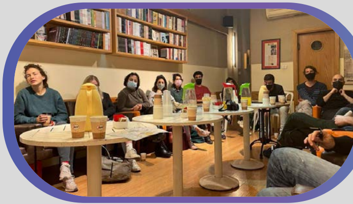
Participants getting introduced to the project framing and the expectations for the course. Presenting the core issues of the conflict, Jerusalem 7.1.2022.