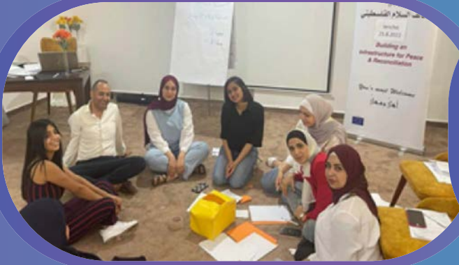
Participants having a discussion on the current political situation and the most important developments on the Palestinian, international and regional arenas and the role of women in decision-making, Jericho 26.8.2022.