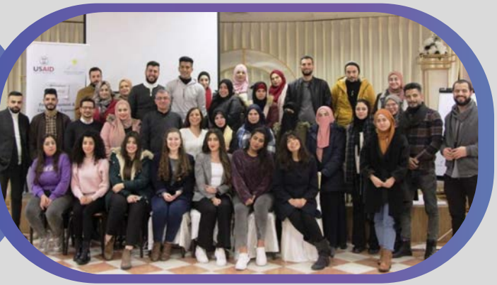
Participants gather after the Local training courses the covered communication & media skills, including training on public outreach and Advocacy Initiatives and Peace & Reconciliation, Bethlehem 21-22.1.2022.