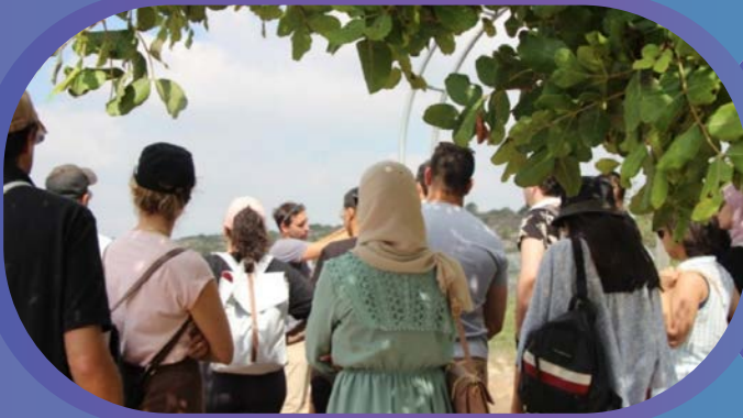
participants sharing and correcting preconceptions about the other side and some sharing personal stories of their experience in the conflict., Haifa 18-19.8.2022