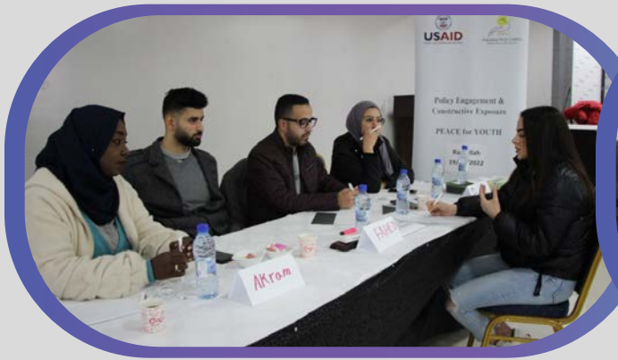
Participants discussing barriers to women and youth's participation as well as methods to overcome said challenges Ramallah 18-19.3.2022.