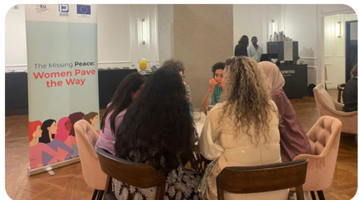
Dialogue meeting for Israeli and Palestinian women leaders, June