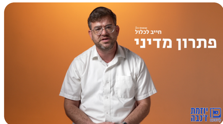
Video featuring graduates of the Geneva Initiative’s young leadership program