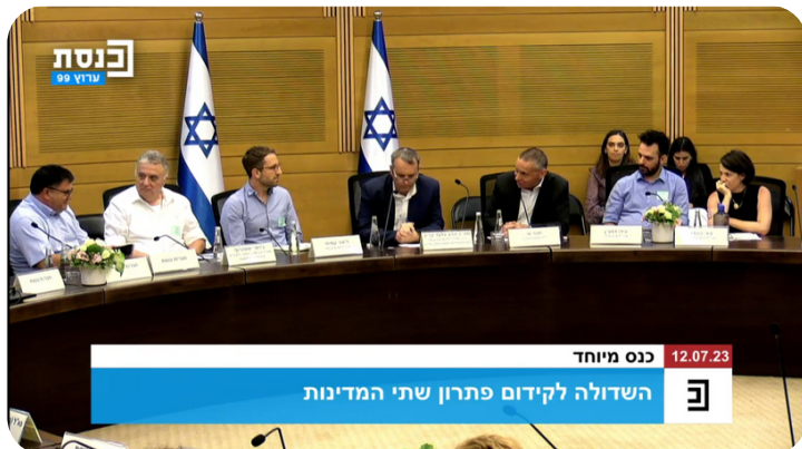
Launch event of the Two-State Solution Lobby chaired by MK Gilad Kariv, July

“Those who do not hold continued political dialogue with the leadership of the Palestinian Authority will end up holding negotiations with the Islamist terrorist organisations and strengthening them.” - MK Gilad Kariv, following his visit to Ramallah with the Geneva Initiative, August