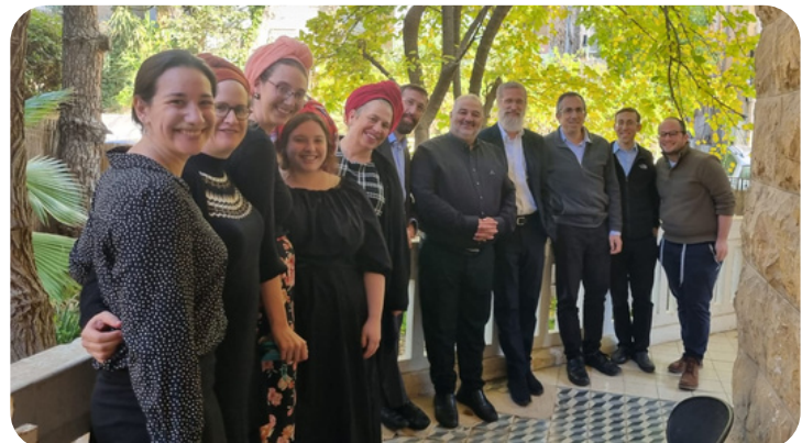
Jewish religious leaders meet MK Mansour Abbas, December