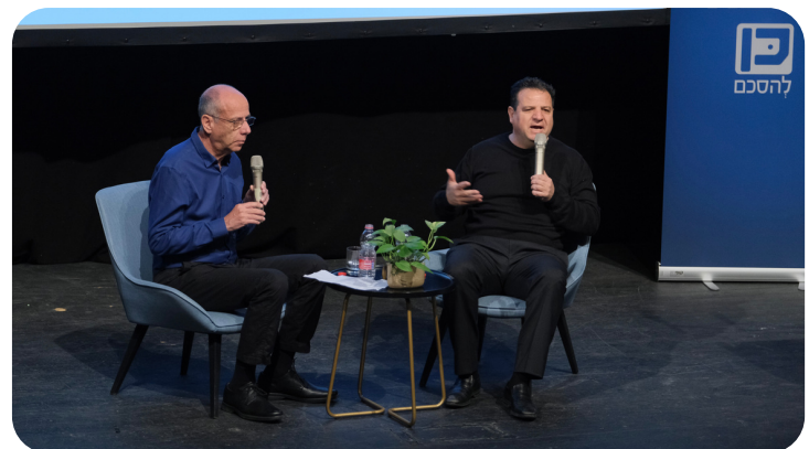
Conversation with MK Ayman Odeh, leader of the Joint List party