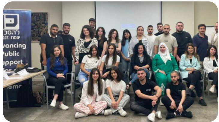
Dialogue meeting for young leaders, April