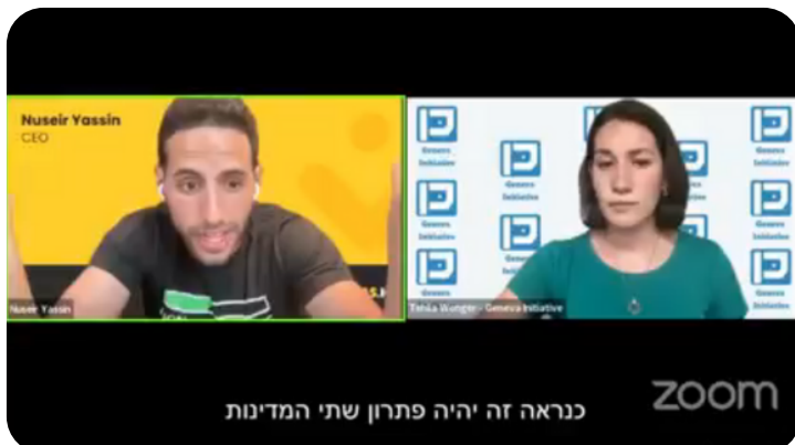
Conversation with Nas Daily, an Israeli-Palestinian viral content creator, and close to 350 young Israelis and Palestinians, June