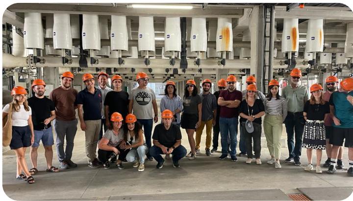
Representatives of the Israeli and Palestinian coalition on a joint tour of the desalination plant in the Gaza envelope, September

The Geneva Initiative is proud to lead a coalition of over 20 Israeli and Palestinian civil society organisations working to promote a two-state solution. This year we met dozens of decision makers and public opinion shapers, in Israel and around the world, to promote public discourse and political action