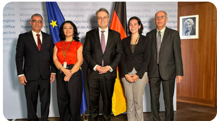
Israeli and Palestinian representatives of the Geneva Initiative with Tobias Lindner, German Minister of Foreign Affairs, September