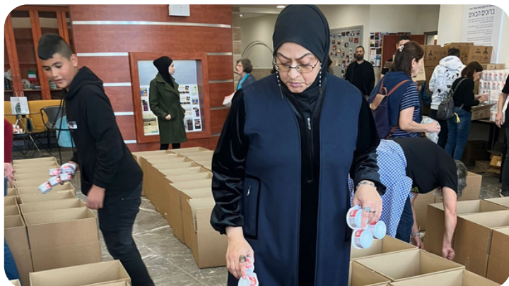
Jewish and Arab participants of our female leadership project join the volunteer effort in Rahat