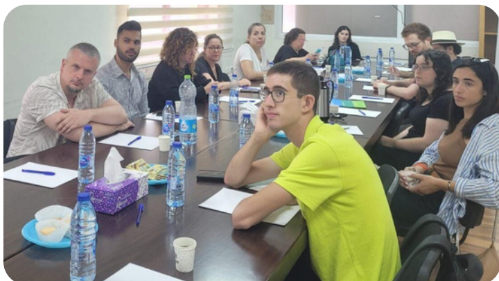
Parliamentary advisors and journalists in a meeting with senior figures in Ramallah, September