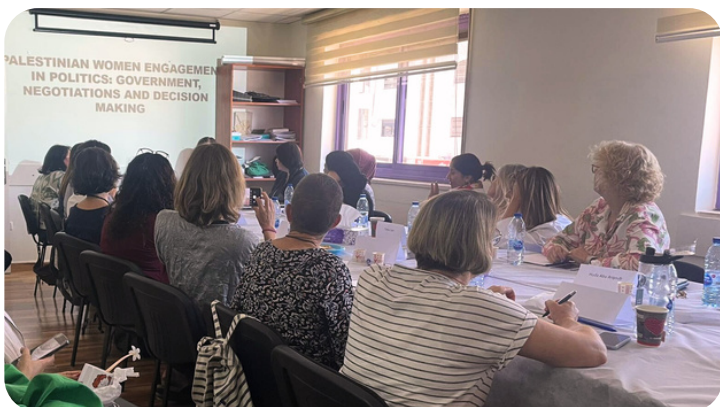
Women leaders at a joint meeting in Ramallah, August