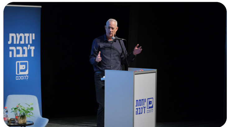
MK Benny Gantz, leader of the National Unity party