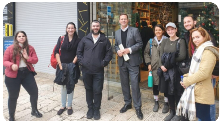
Religious, ultra-orthodox and secular young leaders on a tour in Jerusalem, January