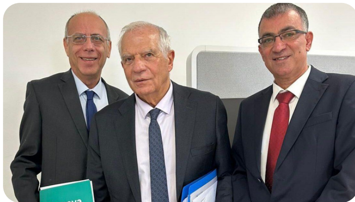
Israeli and Palestinian Directors of the Geneva Initiative with Josep Borrell, EU High Representative for Foreign Affairs, November

This year, together with our Palestinian partners, we met dozens of ministers, members of parliament and foreign ambassadors, in order to make a clear joint call for a two-state solution