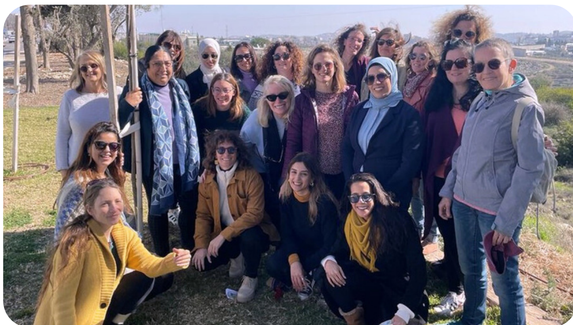
Female leadership seminar, January

Israeli-Palestinian Educational Activities