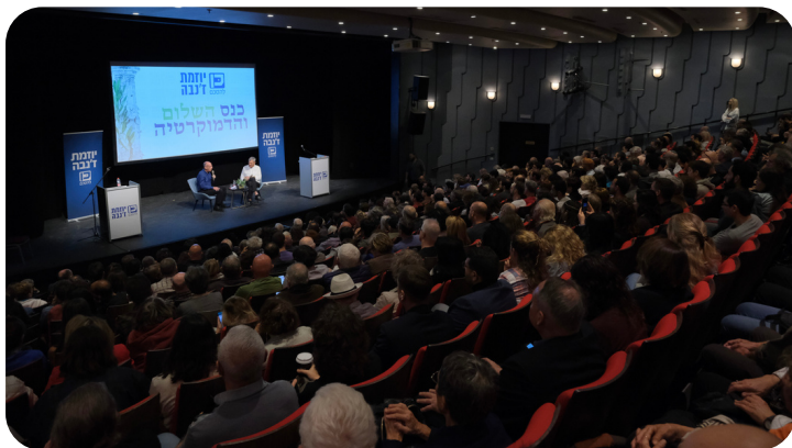
The audience listens to a conversation with MK Ram Ben Barak, Yesh Atid

Nearly 500 people, including party leaders, Knesset members and experts, attended a special conference we held to discuss the connection between the fight for democracy and the fight for peace