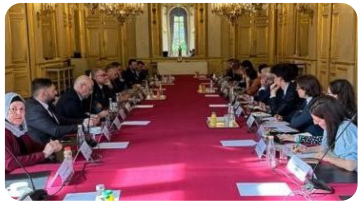
A delegation of the Two-State Coalition in conversation with senior officials in the French Ministry of Foreign Affairs, May