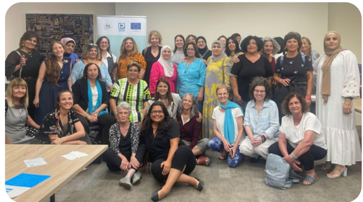
Dialogue meeting between Arab and Jewish women leaders, July