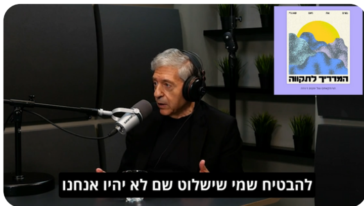
Yossi Beilin, the Chairman of the Geneva Initiative, on the war in Gaza and ‘the day after’, in our new podcast, “The Guide to Hope”

Following the horrific attacks on Israeli civilians on October 7th and subsequent outbreak of war in Gaza, our work has been divided into two main tracks: high-level projects for planning ‘the day after’ the war and the opportunities that will arise, and public action emphasizing that only a two-state solution will bring long-term security