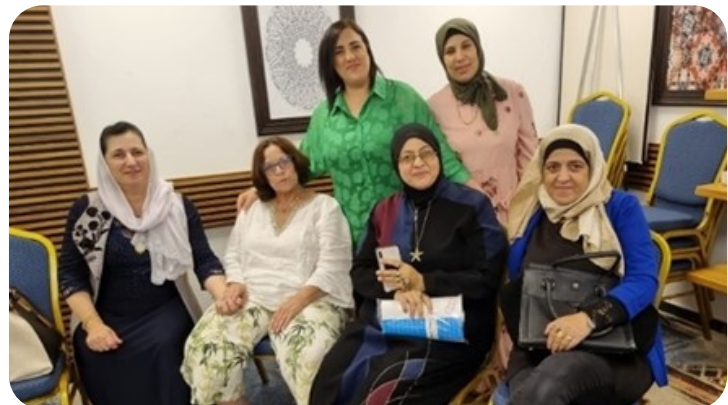
Meeting for Arab female leadership in Nazareth, May