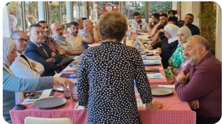
Meeting for youth members of the Ra'am party and several MKs with Israela Oron, August