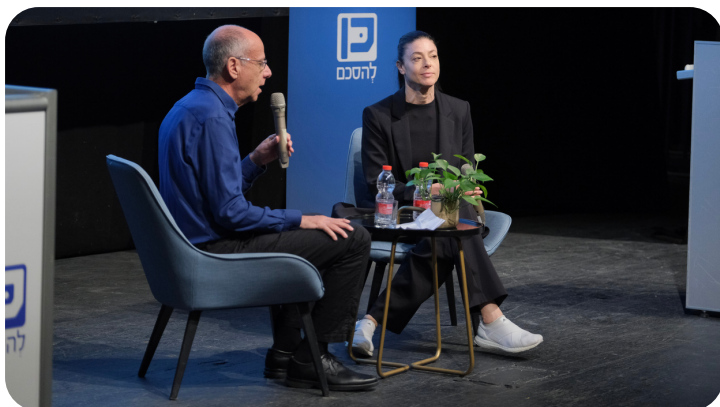
Conversation with MK Merav Michaeli, leader of the Labour party