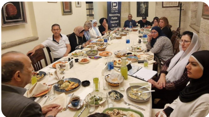
Local leaders in a meeting in Jerusalem, July