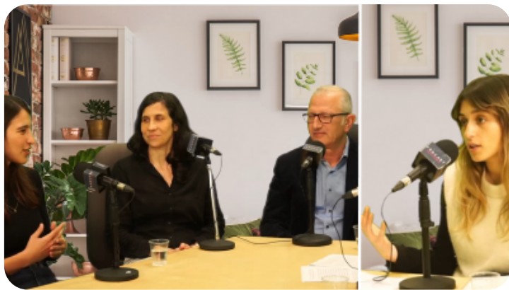
The recording of a special episode of our podcast 'The Road to an Agreement' on the relationship between the judicial overhaul and the conflict, March